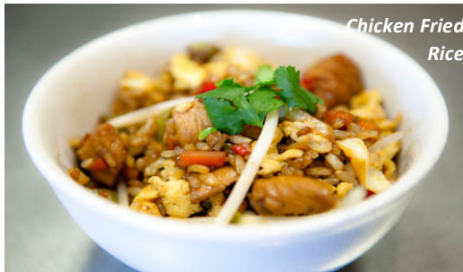
Chicken Fried Rice